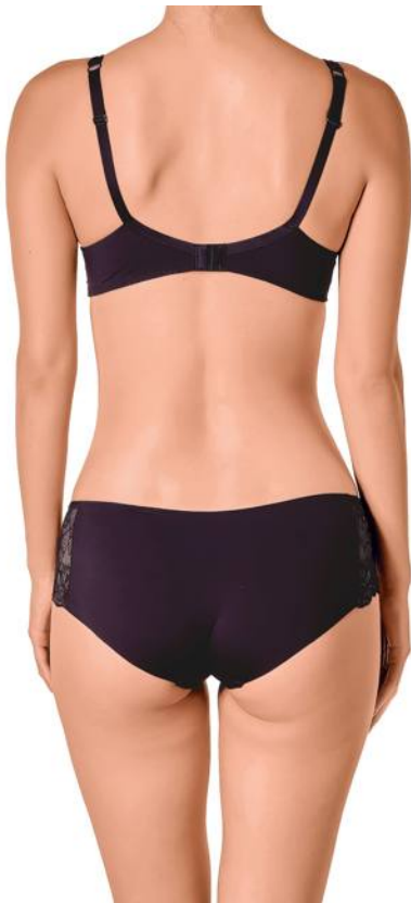
GRJ-K10 Shorty FR/UE 36-44 US/UK XS-XL