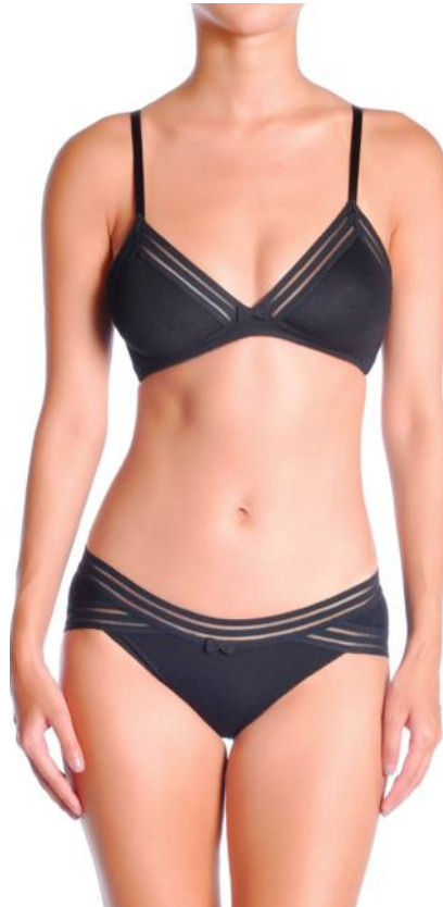
SWC-B1 Soft Bra / Bralette FR 80-95 A, B, C UE 65-80 A, B, C US/UK 30-36 A, B, C