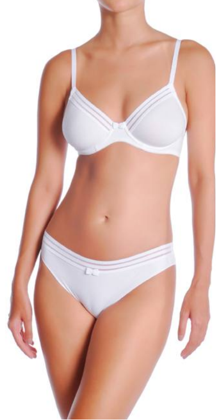
SWC-A0 Underwire Bra / Armature FR 80-100 B, C, D, E UE 65-90 B, C, D, E US/UK 30-38 B, C, D, E