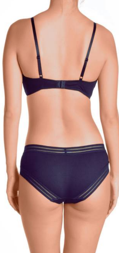
SWC-K10 Shorty FR/UE 36-44 US/UK XS-XL