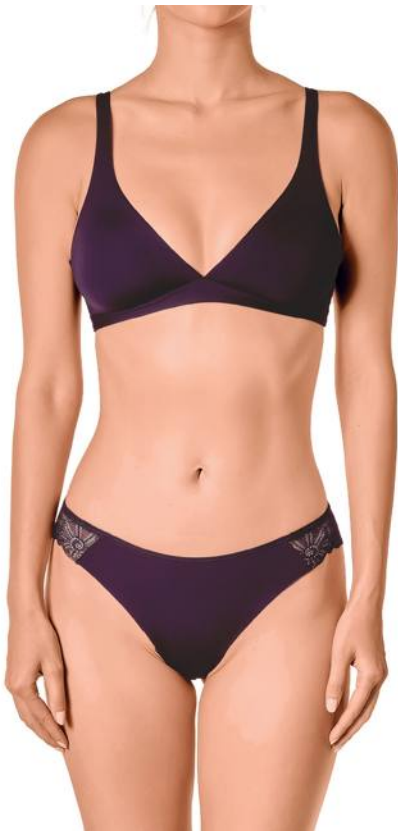
GRJ-B1 Soft Bra / Bralette FR 80-95 A, B, C UE 65-80 A, B, C US/UK 30-36 A, B, C