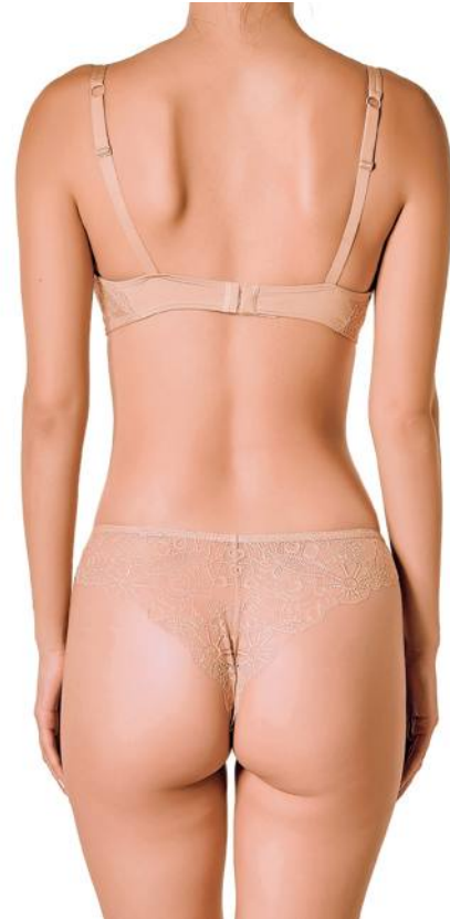
GRJ-J10 Tanga / Bresilien FR/UE 36-44 US/UK XS-XL