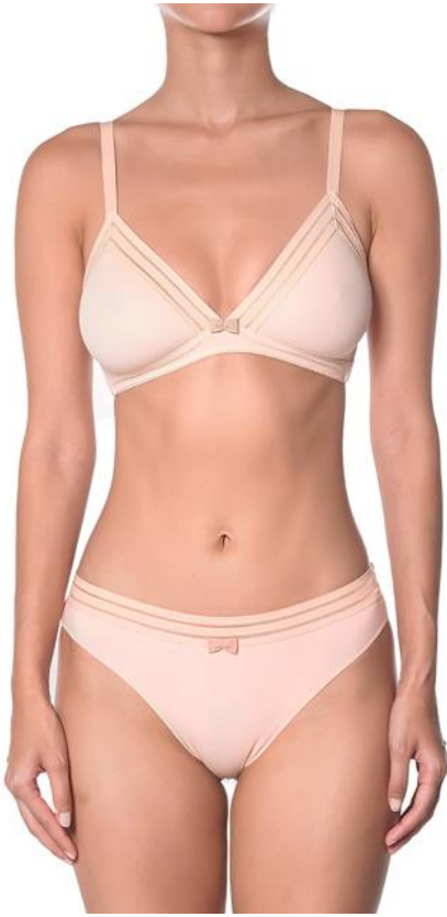
SWC-B1 Soft Bra / Bralette FR 80-95 A, B, C UE 65-80 A, B, C US/UK 30-36 A, B, C