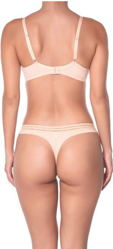
SWC-J10 Thong FR/UE 36-42 US/UK XS-L