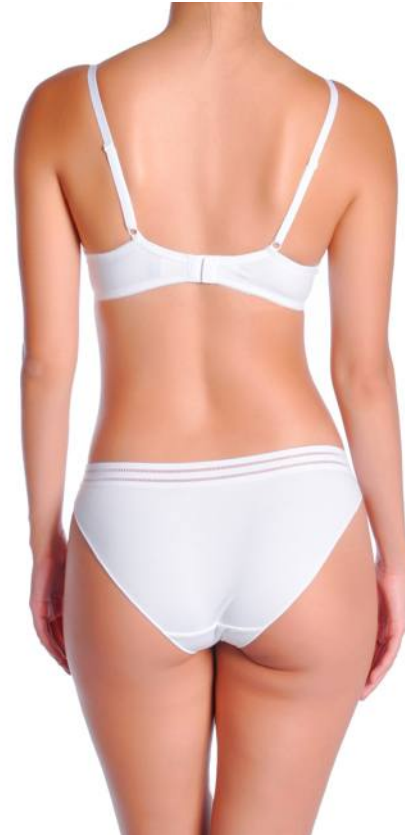
SWC-J20 Brief / Culotte FR/UE 36-44 US/UK XS-XL