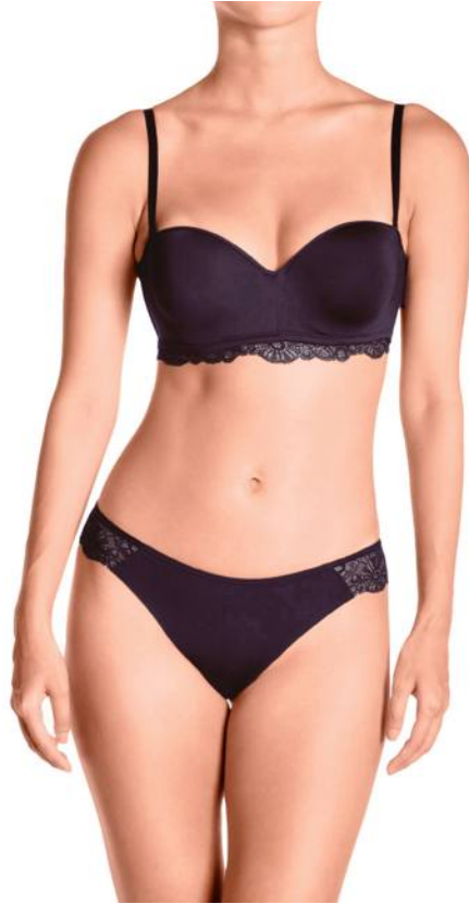
GRJ-D7 Strapless / Bretelles amovibles FR 85-95 A, B, C, D UE 70-80 A, B, C, D US/UK 32-36 A, B, C, D