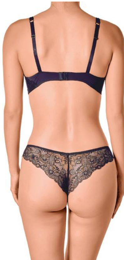
GRJ-J10 Tanga / Bresilien FR/UE 36-44 US/UK XS-XL