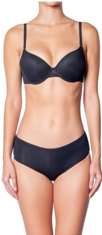
FOS-B26 Padded Contour Bra FR 85-95 A, B, C, D, E UE 70-80 A, B,C, D, E US/UK 32-36 A, B, C, D, E